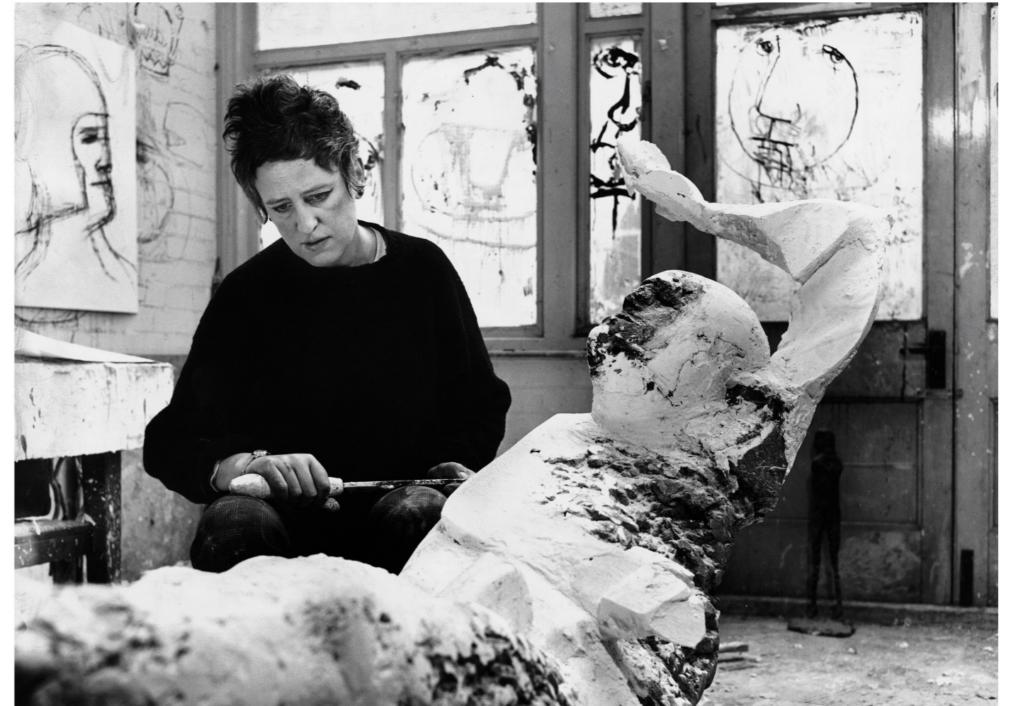
Elisabeth Frink, 1963