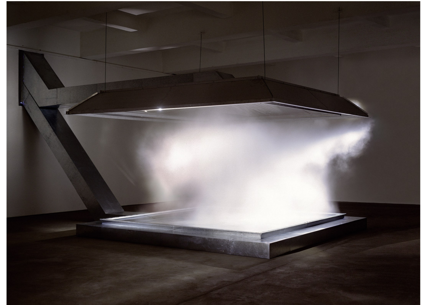
Rose Finn-Kelcey Steam Installation

For further information about the AGBI grants programme, to refer a potential applicant or for general enquiries contact the office on 020 7734 1193.