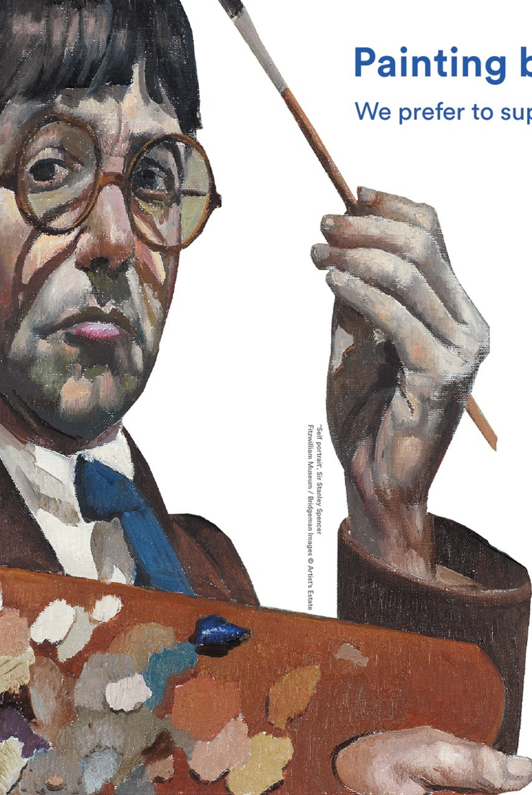
Self portrait, Sir Stanley Spencer