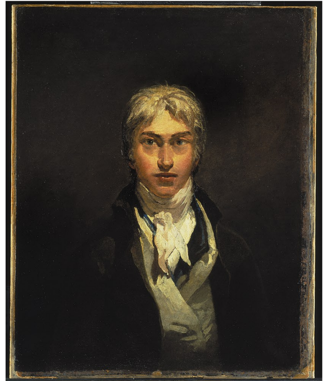
Joseph Mallord William Turner Self-Portrait c1799 Oil paint on canvas

Any professional fine artist can apply for help if they have earned their living (or a major part of it) from art and cannot work due to personal accident, illness or incapacity due to old age. Widows and orphaned children of artists are also eligible for help.