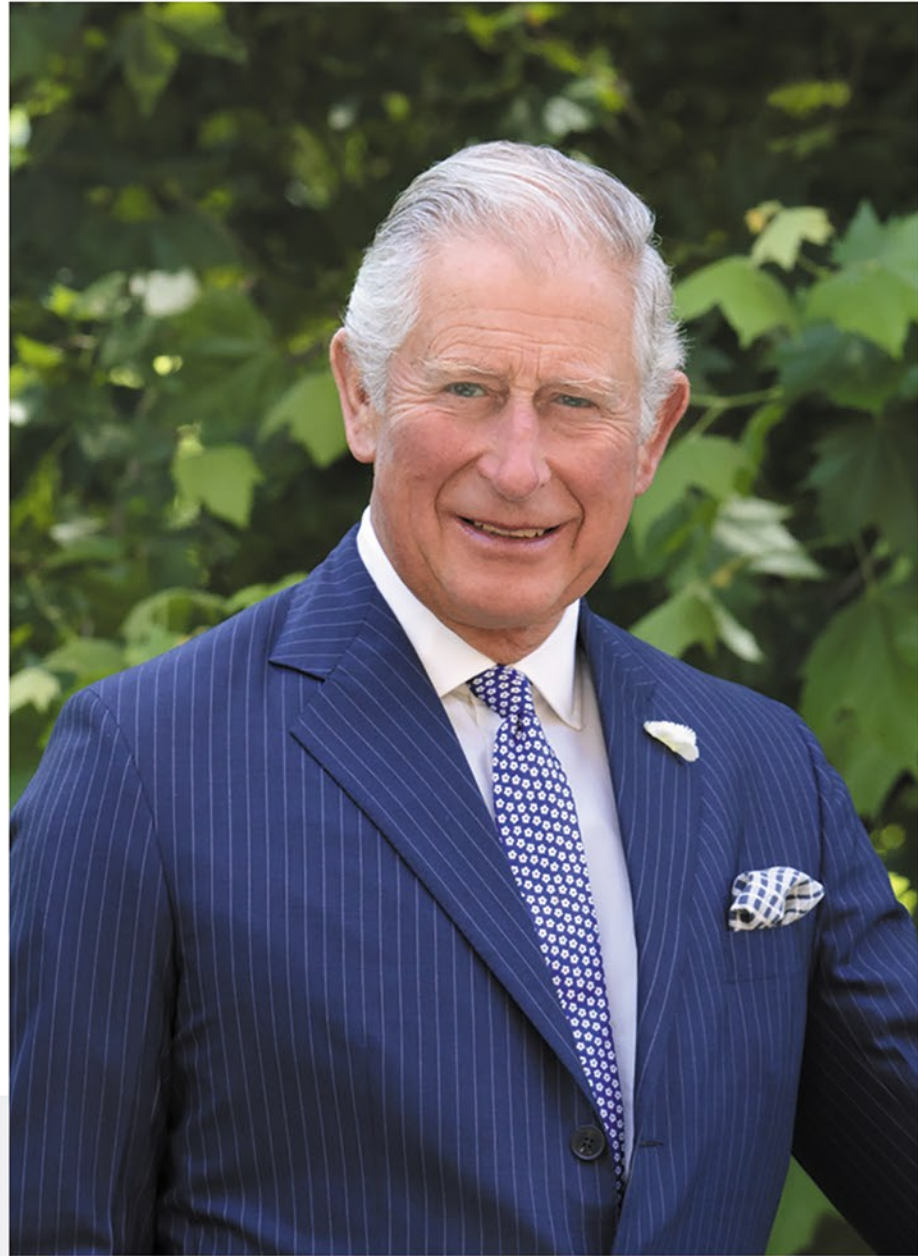
The Prince of Wales