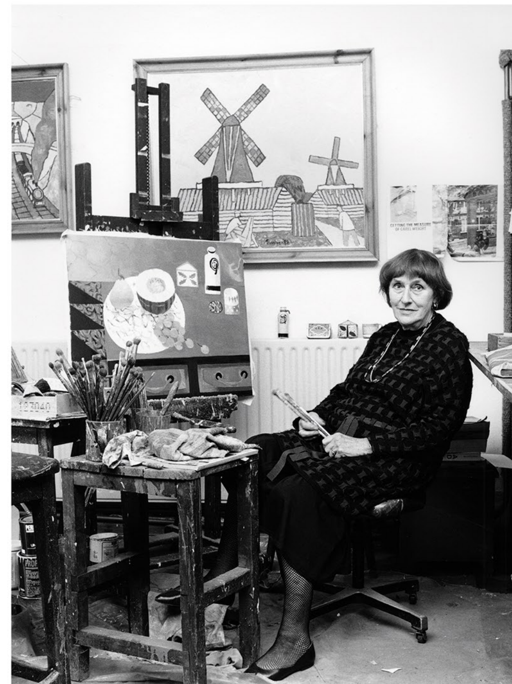
Mary Fedden OBE RA Past AGBI Steward and AGBI Council Member

We remain incredibly grateful to all our Stewards for their hard work and continued support of the AGBI.