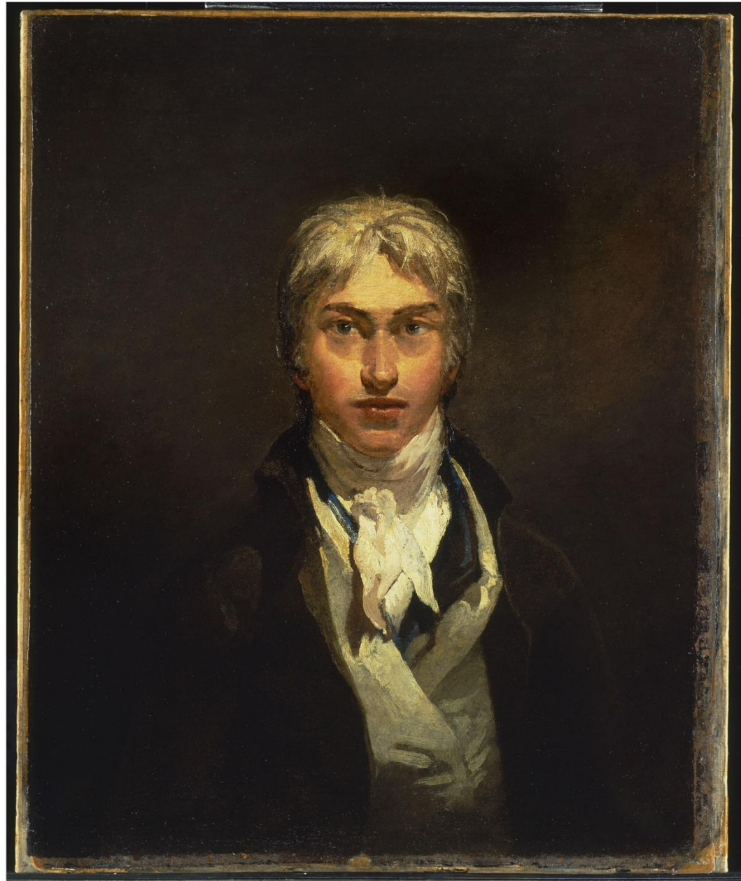
Joseph Mallord William Turner Self-Portrait c1799 Oil paint on canvas