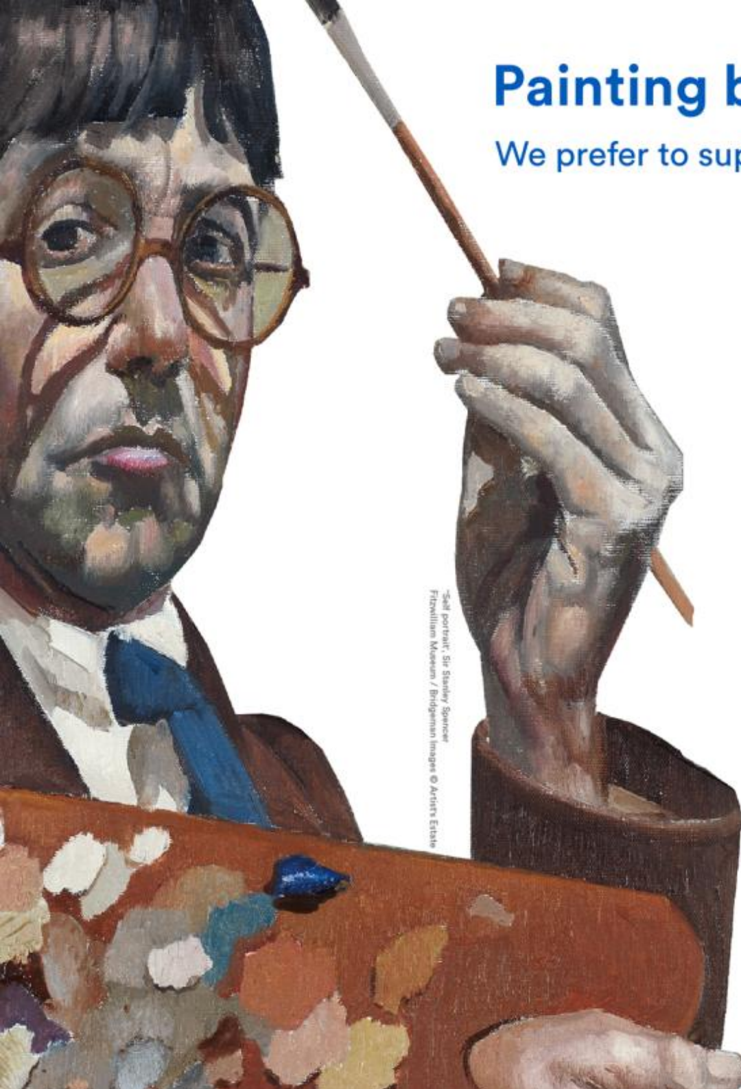
Self portrait, Sir Stanley Spencer